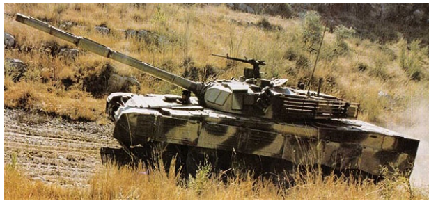
Chinese Type 90 Main Battle Tank

The description of the “horses” in the vision, upon which the men were riding, fit exactly the description of modern tanks. Tanks were the vehicles of choice for transporting soldiers of the Russian army in WWII when they pushed the German army back to Berlin. Russian tanks were so crowded with soldiers in this campaign, that some fell off and were crushed under the treads of the following tanks. Remember that the apostle John had never seen any vehicle other than horse-drawn chariots. To him, anything upon which men were riding was a large “horse”.