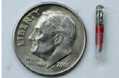
Dime and Verichip

VeriChip is expected to sell for about $200. A scanner used to read information contained in the chip would cost between $1000 and $3000. A doctor would insert the chip with a needle-like device.” 15