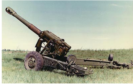
Towed Chinese Type 66, 152 mm Gun-Howitzer

Verse 19 says that the power of the “horses” was in their mouths and in their tails, the tails being like serpents, having heads with which they do harm. The tail of each “horse” is a towed artillery piece, the barrel of which has a bulbous flash-hider or muzzle brake at the end. All modern artillery has this characteristic.