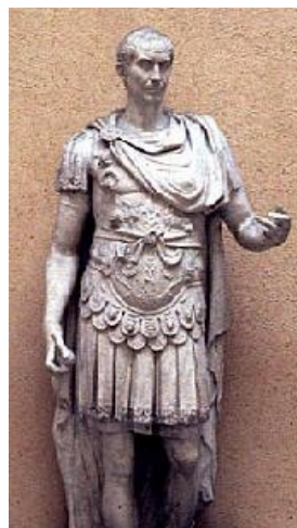
Caesar as general