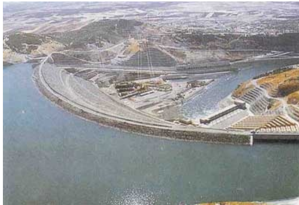
Ataturk Dam on the Euphrates River

What is the mechanism for drying up the deep and wide Euphrates River? Currently there are three major dams operational on the Turkish portion of the Euphrates River, the Keban, Karakaya, and the Ataturk. Two more, the Birecik and the Karakamis, are under construction. 17 In addition, Syria has built a dam on the Euphrates called the Tabqa Dam. It was built at the city of Tabqa, also called Thawra (Revolution). 18 It is estimated that Turkey contributes 89% of annual flow and Syria contributes 11% of the Euphrates River flow. 19 If Turkey shut off its dams on the Euphrates River, very little water would enter Syria, not to mention the possibility of Syria shutting off its Tabqa Dam as well. This would completely dry up that major Asian river, which would otherwise present a formidable barrier to any large army.